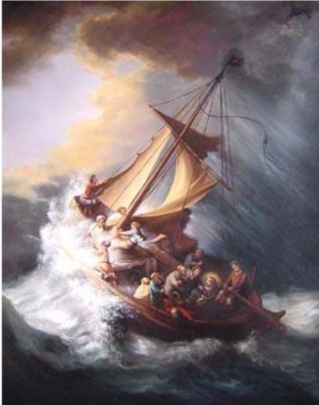
The Storm on the Sea of Galilee Rembrandt, 1633

Should financial resilience be part of public policy?