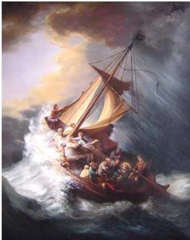
The Storm on the Sea of Galilee Rembrandt, 1633

Should financial resilience be part of public policy?