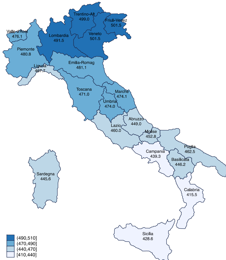
Figure 1. Descriptive statistics on financial literacy competence, by region.