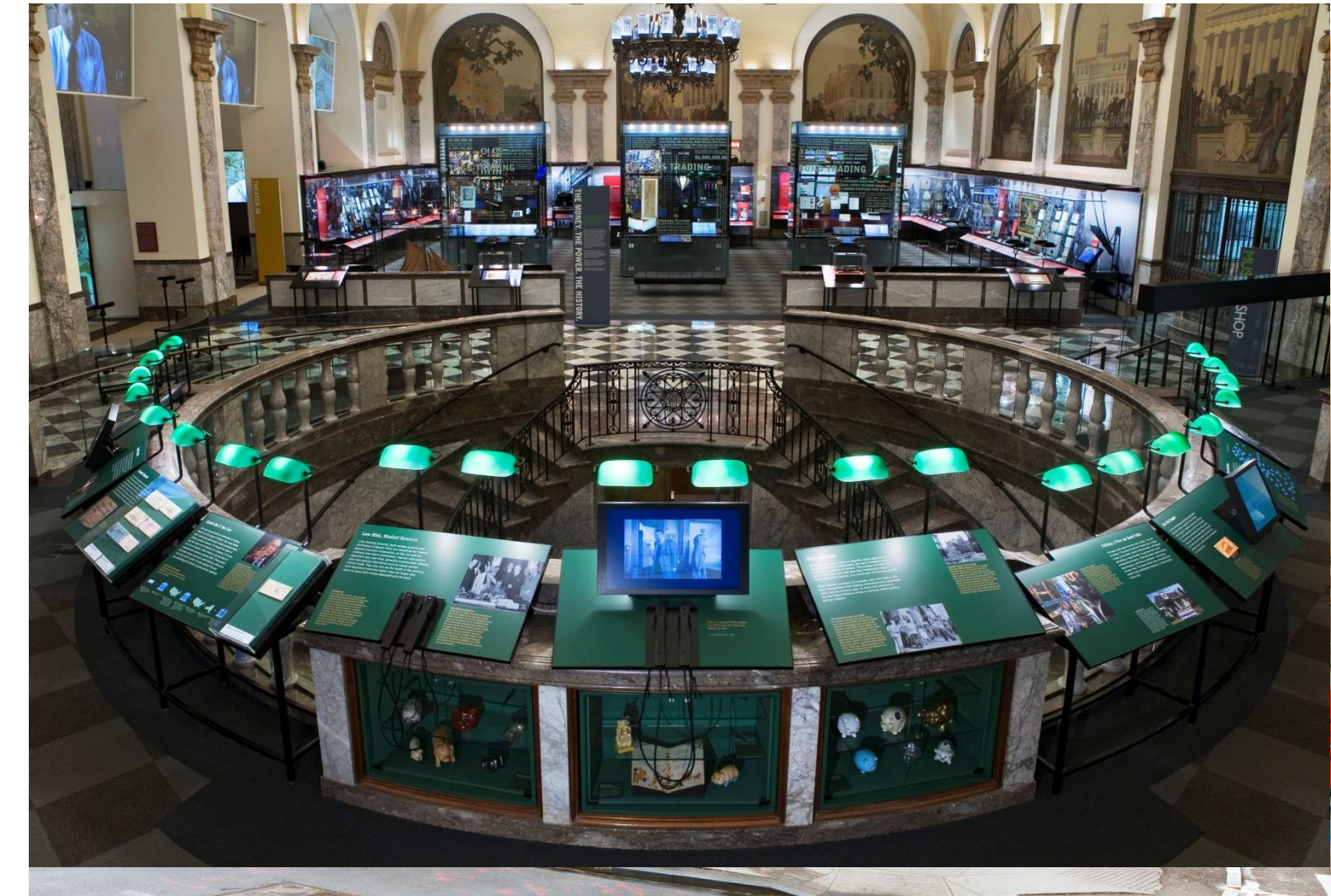
48 Wall Street: Corner of Williams St. and Wall St.