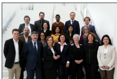
OECD/GFLEC Host 2nd Annual Global Policy Research Symposium