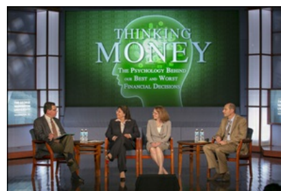
GFLEC and FINRA Host Screening of Thinking Money Documentary