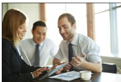
Featured Research: Five Steps to Planning Success